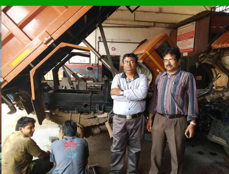
SBU:G&L participated in the SML-ISUZU free service camp conducted at Silver Motors Manjeri-Malapuram District, Kerala in January 2016. The event received good response and helped in increasing branding of our company