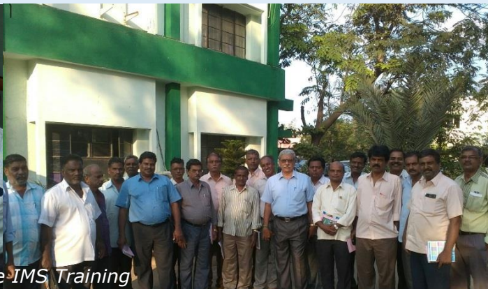
Participants of the IMS Training