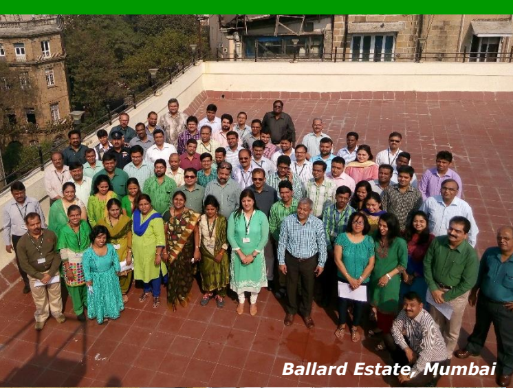
Ballard Estate, Mumbai