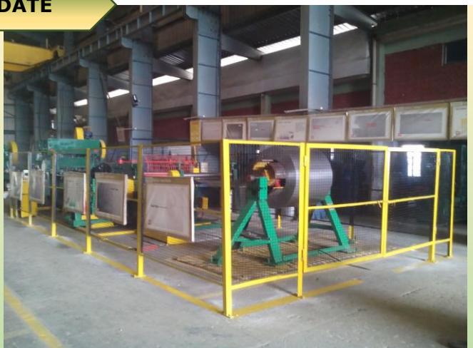
Machine guarding at de-coiling section, IP - Asaoti