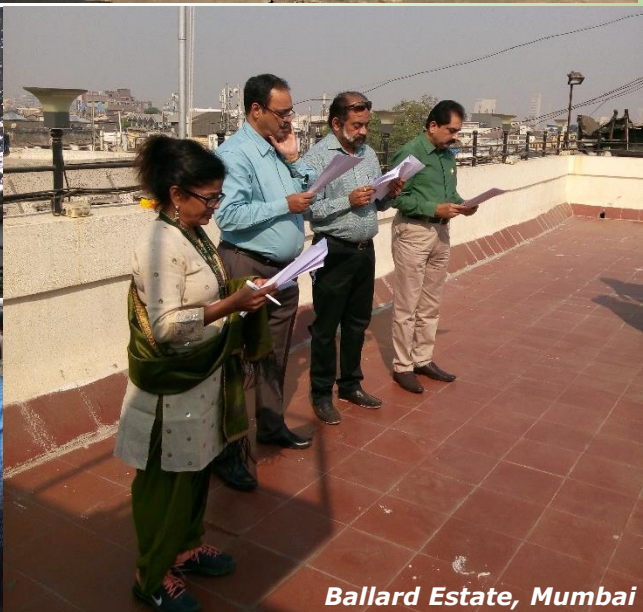
Ballard Estate, Mumbai