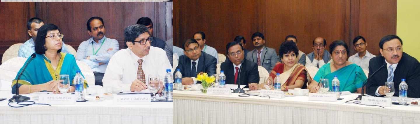
A study visit of the committee on papers laid on table, Rajya Sabha Kolkata, West Bengal was hosted by Balmer Lawrie and other Companies at the Grand Hotel, Kolkata on 1 st & 2 nd February 2016.