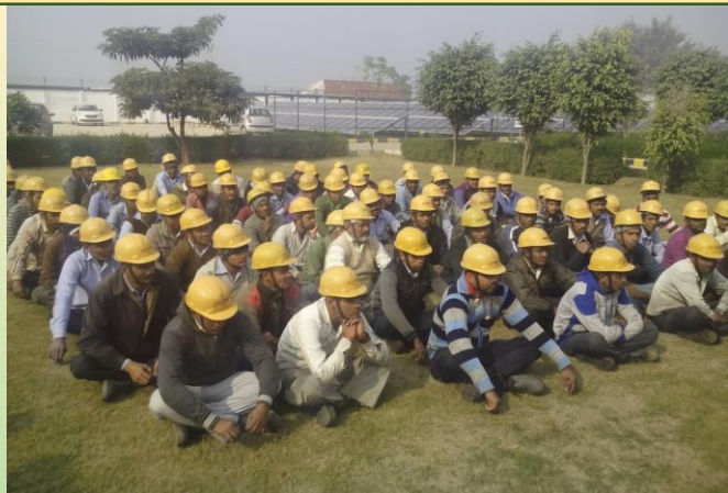
Tool box talk at IP - Asaoti