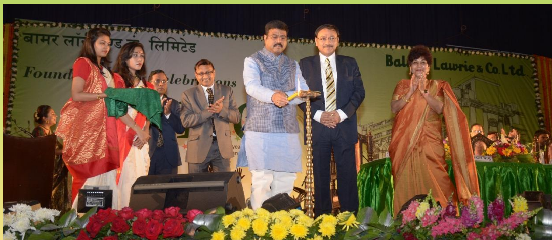
Hon'ble Minister inaugurating the function at Kolkata in the presence of C&MD and Directors

The first week of February witnessed moments that we would fondly cherish in the years to come. After the week long celebrations starting from 1 st February, all of us celebrated the 150 th Foundation Day along with our families with great enthusiasm. While the units and establishments across the country celebrated the occasion on 7 th February, the Eastern Region celebrated it on 12 th February. It was indeed a matter of great pride and honour to have Shri Dharmendra Pradhan, Hon'ble Minister of State (Independent Charge), Ministry of Petroleum & Natural Gas, as the Chief Guest of our function at Kolkata. All of us are extremely grateful to him for taking time off his busy schedule to join us in the celebrations. His presence was of immense motivation and we were highly privileged to hear from him. We will bring you glimpses of all the programs, Hon'ble Minister's speech and other snapshots of the functions held across locations in a special issue of Balmer Lawrie Organisational Gazette [BLOG] soon.