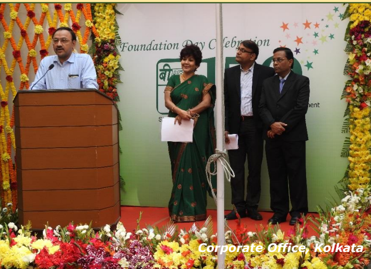
Corporate Office, Kolkata