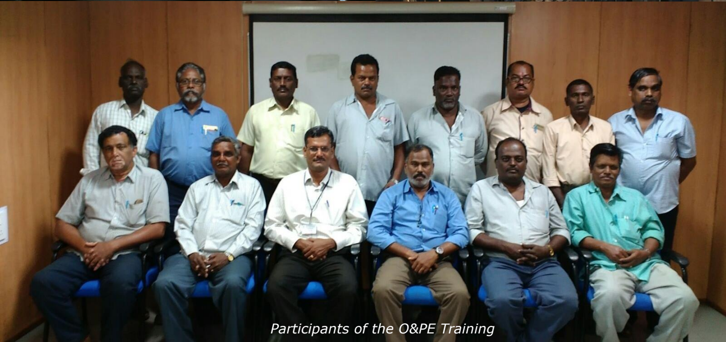
Participants of the O&PE Training

Three training programs were organised for employees in the Non-Officer category in Chennai. On 2 nd & 4 th January two training sessions were conducted on Integrated Management System (IMS). 51 employees were trained through these sessions. The other training program on Organisational & Personal Effectiveness (O&PE) saw the participation of 22 employees.