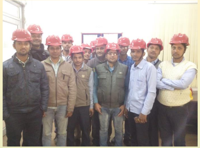
HSE team members with Red Helmets, IP - Asaoti

The IP - Asaoti Team did a commendable job in improving the overall HSE performance of the unit. Based on audit recommendations, 28 numbers of turbo ventilators were installed in the shop floor and special effort was made to improve the guarding in the de-coiling section. The safety stewards at the unit can be easily identified by their red helmets and the safety tool box is appropriately placed everywhere. A unique record of zero LTI has been maintained since the last 4 years. Kudos to team IP - Asaoti for the wonderful job done and wish they sustain zero injury in the years to come!