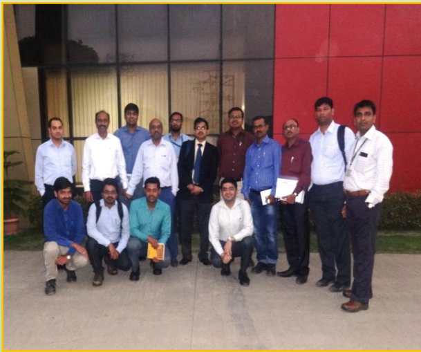
HSE legal training at Mumbai & Silvassa

The IP - Asaoti Team did a commendable job in improving the overall HSE performance of the unit. Based on audit recommendations, 28 numbers of turbo ventilators were installed in the shop floor and special effort was made to improve the guarding in the de-coiling section. The safety stewards at the unit can be easily identified by their red helmets and the safety tool box is appropriately placed everywhere. A unique record of zero LTI has been maintained since the last 4 years. Kudos to team IP - Asaoti for the wonderful job done and wish they sustain zero injury in the years to come!