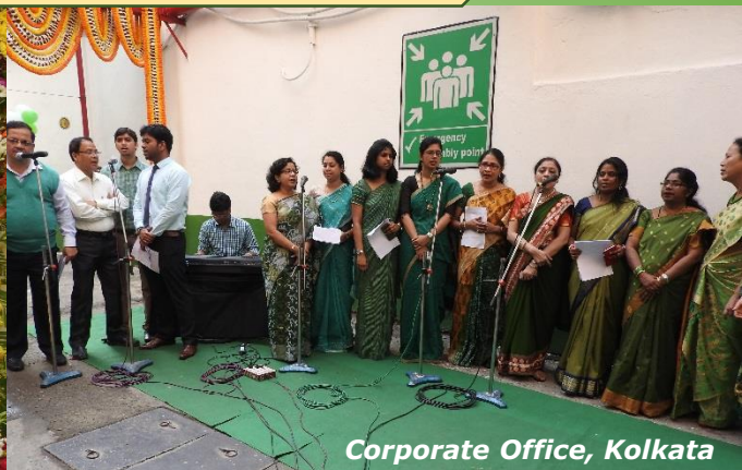
Corporate Office, Kolkata