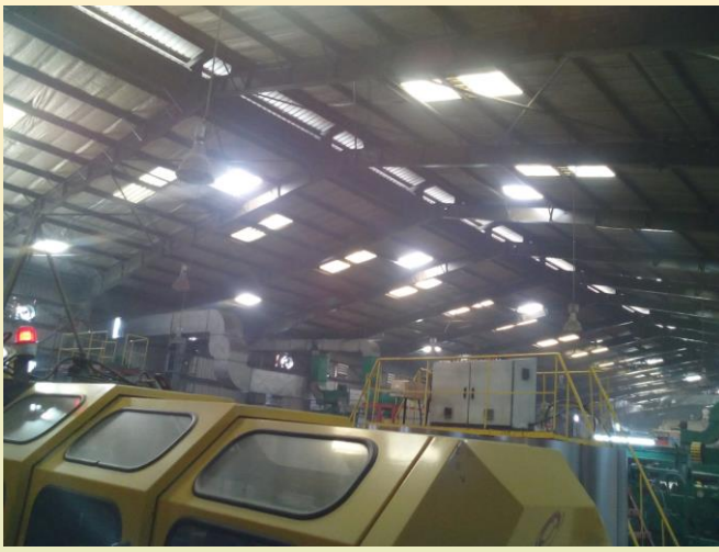
Turbo ventilators in shop floor, IP - Asaoti